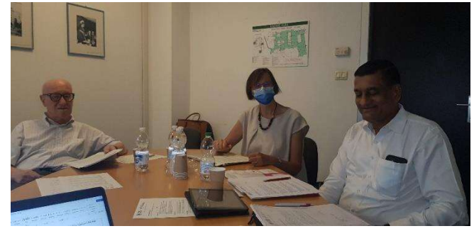
Interaction with First year students in Info Lab, ICTP, Trieste, Italy