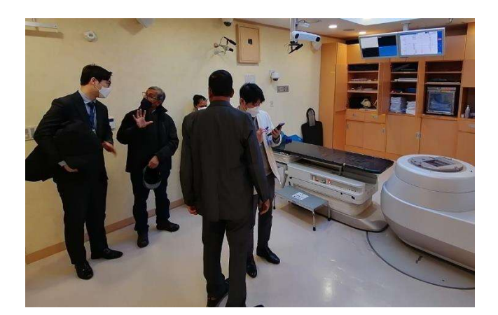
Tour of St. Mary's Hospital

Appendix: Photos taken during IOMP accreditation visit.