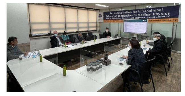
Re-accreditation at Yonsei University