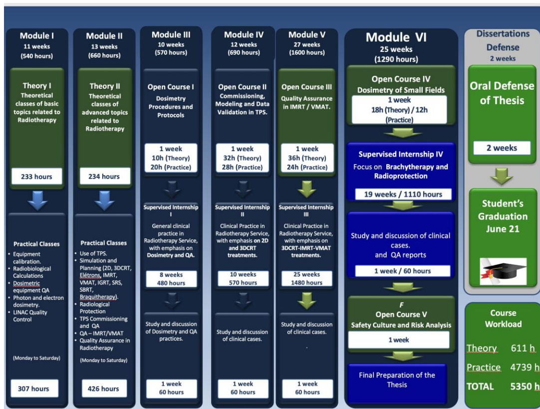
Figure 2. An overview of the course structure

In the selection process, 27 students were initially selected out of 32 applicants to finally result in 22 students from 12 different states (Figure 3).