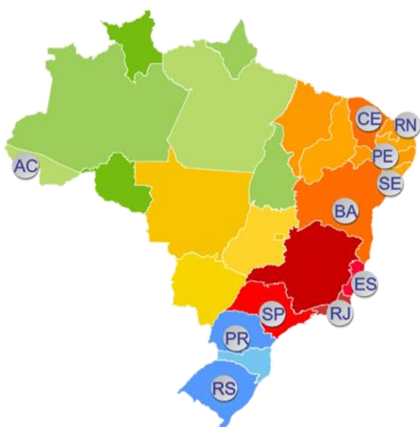
Figure 3. Students initially selected into the program

In the selection process, 27 students were initially selected out of 32 applicants to finally result in 22 students from 12 different states (Figure 3).