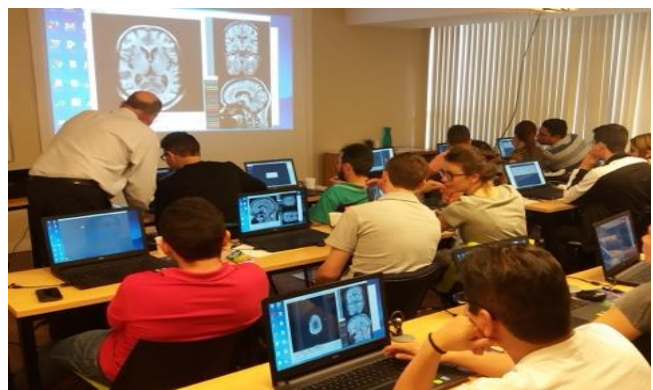
Figure 1b: The TPS being used under proper supervision

The following modules started with a minicourse of 40 hours and then 8 weeks of clinical training. During each phase of the clinical training, they were free to follow the routine defined by the preceptor and in addition the central coordination requested to concentrate and fully register the treatment planning and QA locally used for some of the most prevalent types of tumours such as prostate, breast, lung, colon rectum, lymphoma, head and neck cases.