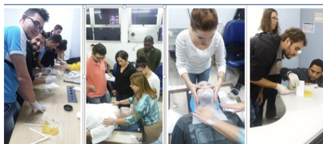
Figure 1a: Exercise on how to make moulds and masks

The first module began with 611 hours of intensive solid academic content, including practical classes providing sufficient information to allow the students to follow the coming activities on the designated cancer centres where the clinical training took place (Figure 1). A treatment planning system (TPS) CAT-3D with a non-clinical license was installed on each computer and a set of typical clinical cases were used for their initial training.